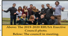
Above: The 2019-2020 RRUSA Executive Council photo. Below: The council in meeting.

For more information about the elections go to www.rrusa.ca