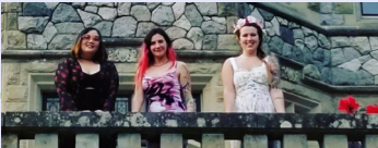
RRUSA President, VP Finance, VP On Campus at the President's Garden Party 2021